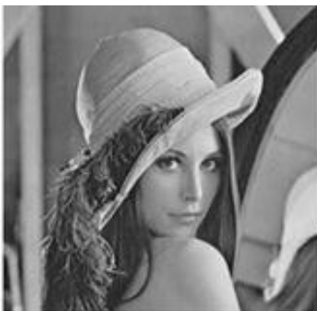
Fig.1. Lena Image is taken as the Input image

In this algorithm the original image is segmented into objects. The segmentation of an image into objects employs many morphological operations such as closing, opening, filling operations followed by edge based segmentation to segment the object from the image, then it is followed by dividing the segmented object into the interior part and the exterior part of the image. Here Lena image is taken as the test image as shown in Fig. 1.