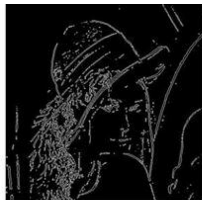
Fig.3. Edge detected image using Sobel operator

The Edge of an image is the basic component of an image and it contains most of the internal information of the image [9]. Therefore detecting edges is one of the key research works in image processing. Image segmentation, segments an object from its background to read the original image properly and identifies the content of the image correctly [8]. In this step the original image is segmented into objects. After performing the Pre-processing stages, edge based segmentation is done. Here Sobel operator is used for edge detection purpose. The edge based image is followed by morphological operation i.e. closing operation, filling and opening operation. The result of the morphological operation on the edge based image gives the segmented object as shown in Fig. 3.