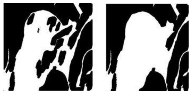
Fig.4. Closed Image and Binary Image with filled holes

The edge detected image using sobel operator undergoes closing operation. The closed image is subjected to filling operation, i.e. a flood fill operation is performed on background pixels by filling holes on the input binary image as shown in Fig. 4.