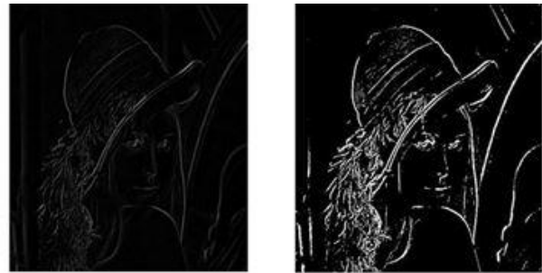
Fig2. Gradient image and the Binarized gradient image

Then edge based segmentation of the binarized gradient image is performed.