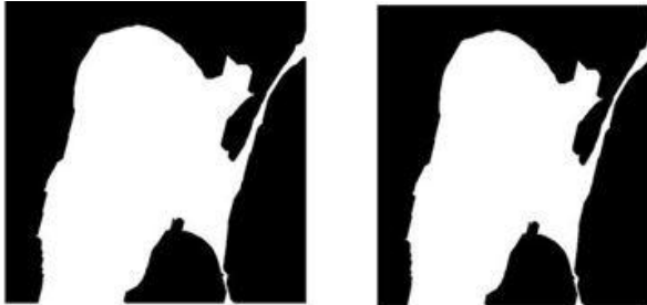
Fig.5. Opened image and finally filled image with holes

The resultant image of this operation is a binary image with filled holes. It is then subjected to Morphological opening of the binary image to remove small objects in the image. The opened binary image further undergoes filling operation resulting in the finally filled image with holes as shown in Fig. 5, in order to properly get the object which is to be segmented.