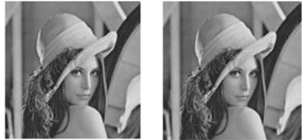
Fig.7. Compressed Image and the Reconstructed Image using the proposed method

further divided into interior part and the exterior part. Both the interior and the exterior separately undergoes transformation techniques. The compressed lena image and the reconstructed image using the proposed method is shown in Fig. 7.